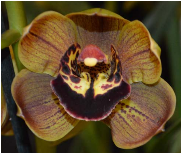
From the Port Adelaide display Mad Rush ‘To Nowhere’