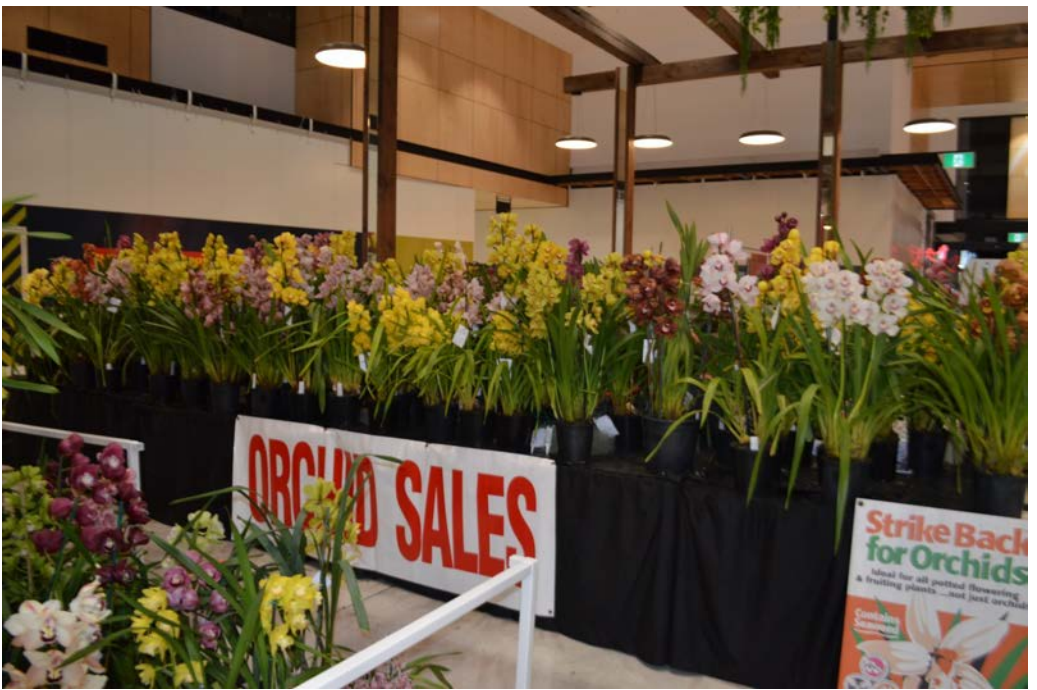
The very busy and successful trading table at the Port Adelaide Display