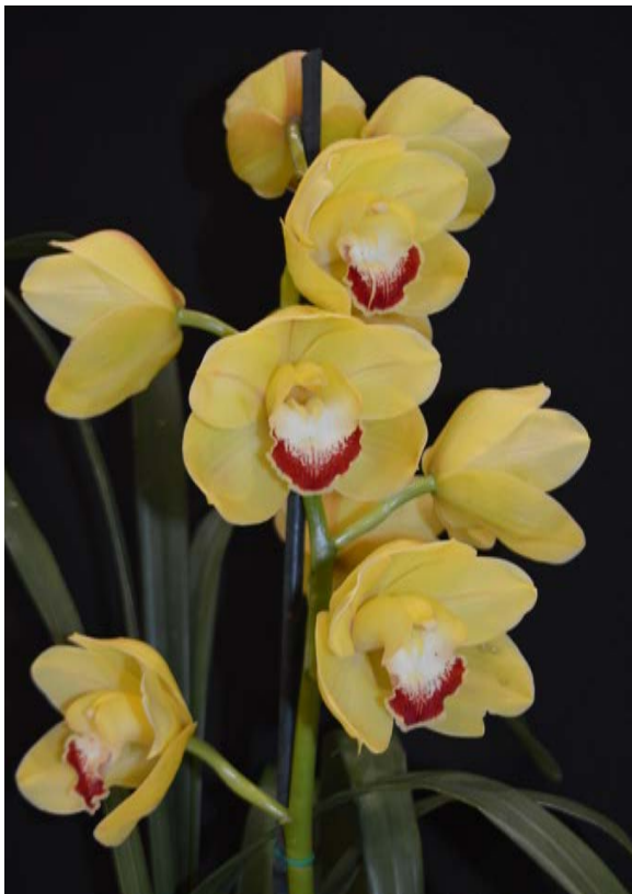
From the Port Adelaide Display Best in First Division Coraki Glowing 'Kentlyn' Grown by Graham Fear