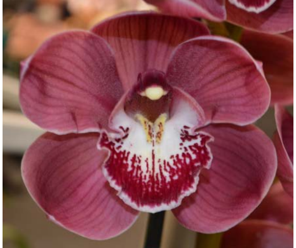
From the Port Adelaide display Khan Fury 'Hope Williams'