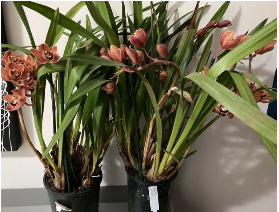
How tough are we? These are the pants shown in the July magazine. They had been in a sealed box for 63 days. Still managed to flower, and look quite recovered See these photographs in colour on the web