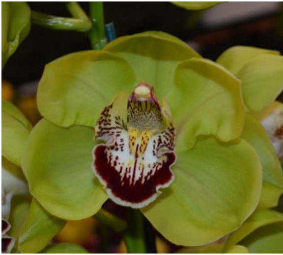
From the Port Adelaide display Kimberley Winter x Paradise Island