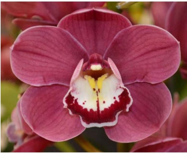
From the Port Adelaide display Olympic Flame 'Ai Tee'