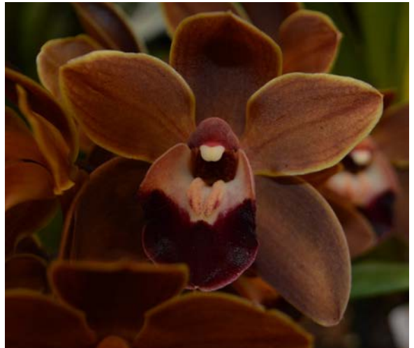
From the Port Adelaide display Jimbo Tupp x Regal Flames