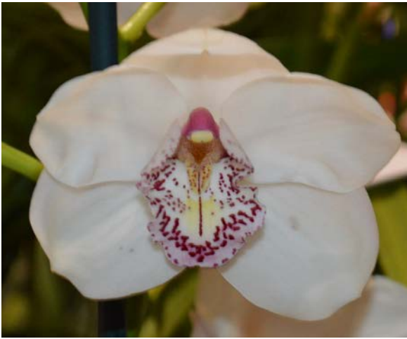
From the Port Adelaide display Vanity Fair ‘Hollywood’