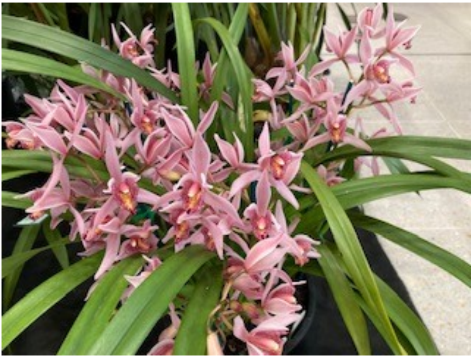
Above Cherry Blossom 'Tiddly Winks' a diploid (2N) form miniature Below Cherry Blossom 'Sharon' a chance tetraploid (4N) form Both plants were shown at the Port Adelaide display. Sharon was much bigger