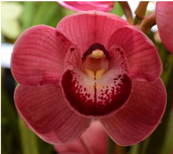
From the Port Adelaide display Kirby Dream