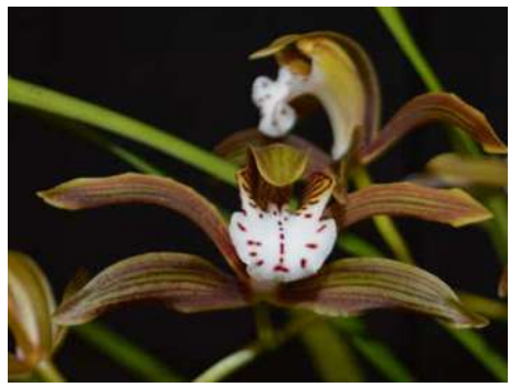
May meeting 2021 Best species erythraeum 'Paradise' x erythraeum 'Lois' Grown by Graham Morris Of interest This plant is an albino (pure colour) carrier for breeding. Erythraeum 'Lois' is an alba