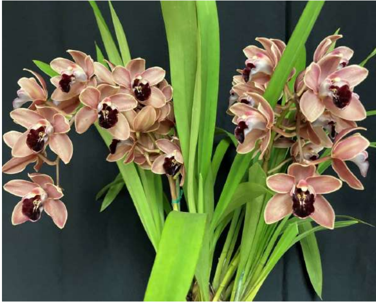
September Meeting Best Intermediate Seedling Clint Eastwood No.2 Grown by John Moon