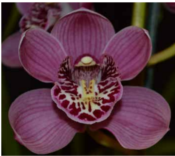
Port Adelaide Show Small Standard Champion Open Division Small Standard Seedling Best (Khanebono x Prized) Grown by Chee Ng