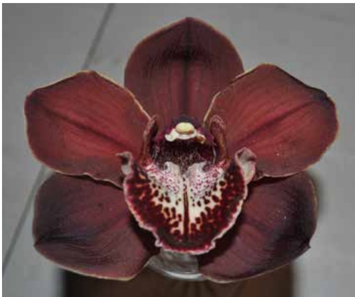
At left Pepper Blaze ‘Blackjack’