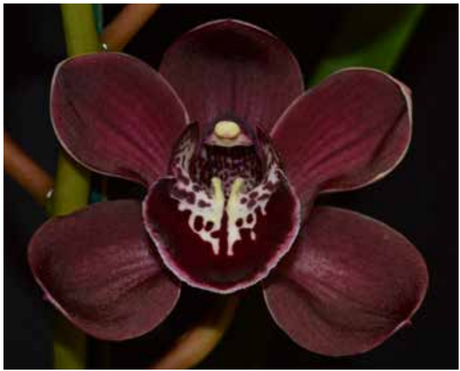
Port Adelaide Show First Division Champion First Division Small Standard Best Small Standard Seedling Best Small Standard Red First (Satin Dragon x Blazing Fury) Grown by Graham Fear