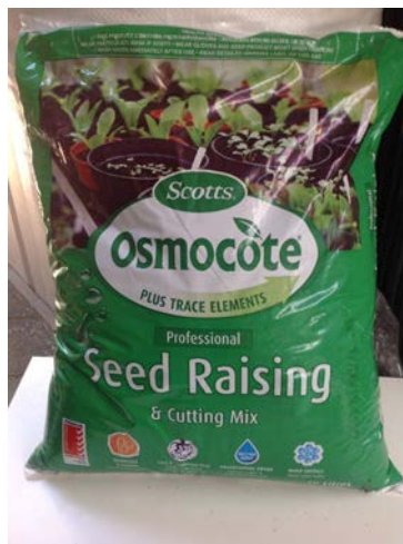
Above Osmocote Seed Raising and Cutting mix

Plants have been grown in conventional growing mediums after potting on from community pots or small trays. The seedling raising mix would probably be very expensive to use for mature plants