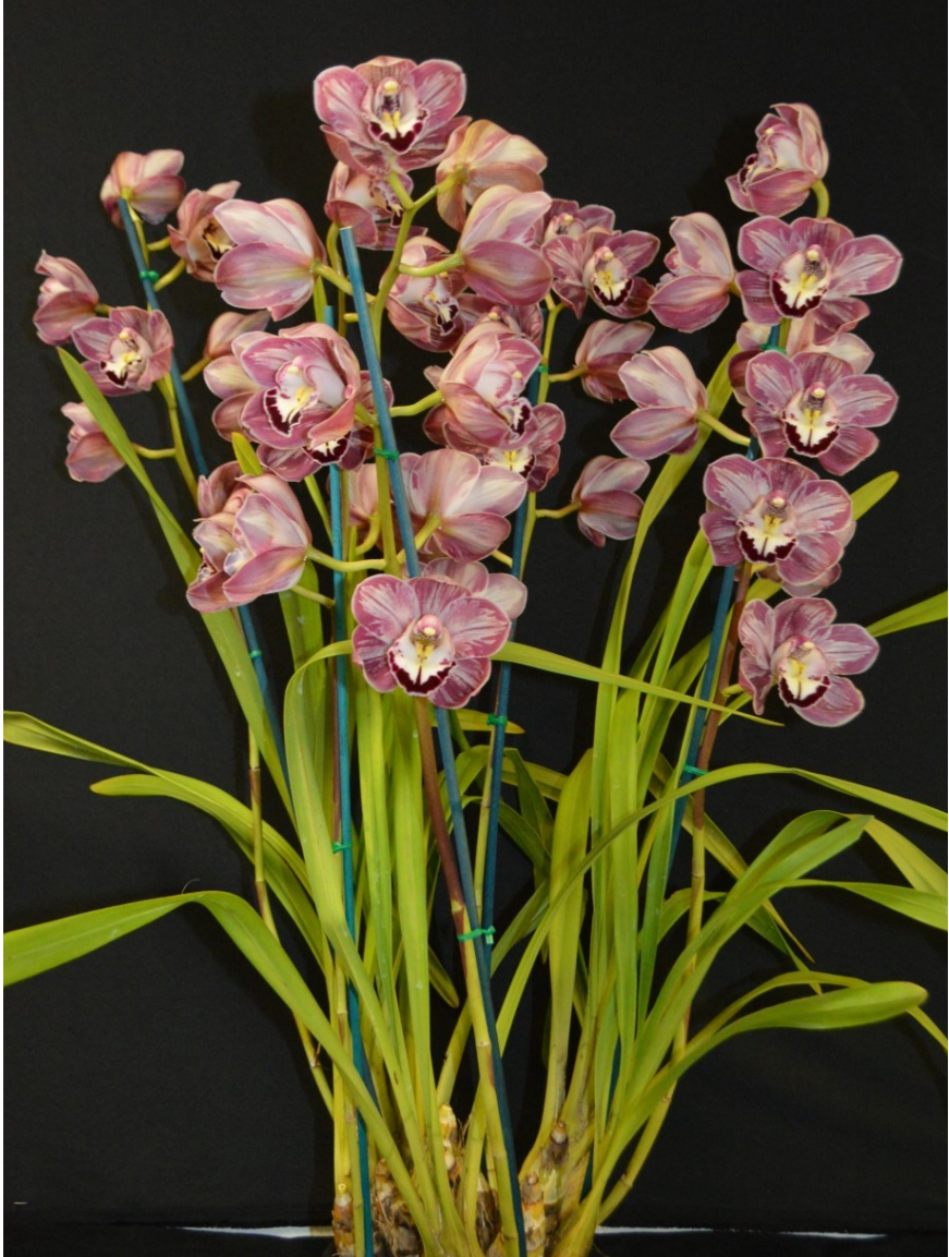
Valley Champion 'Superstar'