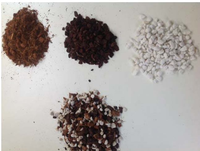
Above Ingredients for home made mix Fine Coco Fibre 6 to 9mm Orchid Bark Perlite Super Coarse