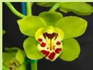
Opera Mint 'Darch'