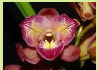
Sweet Wine 'Latour'