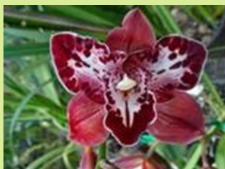
Hot Line 'Plum Loco'