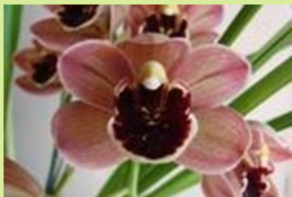
Darch Alex 'Red Eye'

Kevin has a wide selection of plants available. The size of plants varies from single growth to flowering sized seedlings and clones. Flasks of plants are also available. Featured below are some of the clones that are available, many of which are exclusive to Ezi-Gro Orchids.