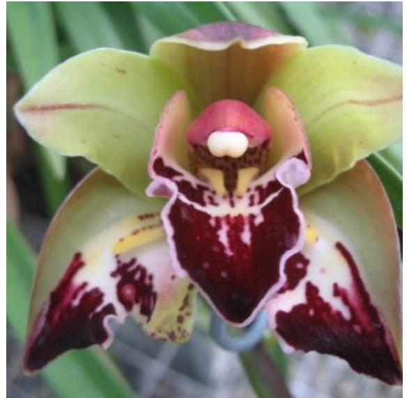
Butterfly Magic 'Springfield'

This will be the last 'Cymbidium Chatter' for March 2020. I hope this finds you well and coping with your new lifestyle, your orchid plants should be benefitting from the extra time you now have available. I have almost completed my repotting and potting-on and I now have my fertilising equipment functioning properly (more on this later).