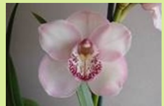
Darch Molly 'Molly'