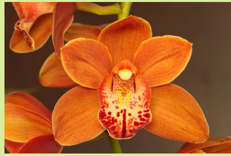
William Weaver 'Kimberley Sunset'

NB: If you do decide to purchase mail order goods please make sure you wash your hands thoroughly after unpacking your plants as the packages will have been handled many times!