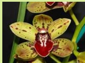
Darch Dots 'Dazzler'