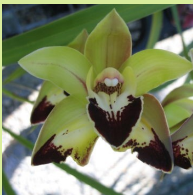
Right: Elusive Butterfly 'Seminal'

Nado offers plants of various sizes and he has some really interesting and different selections.