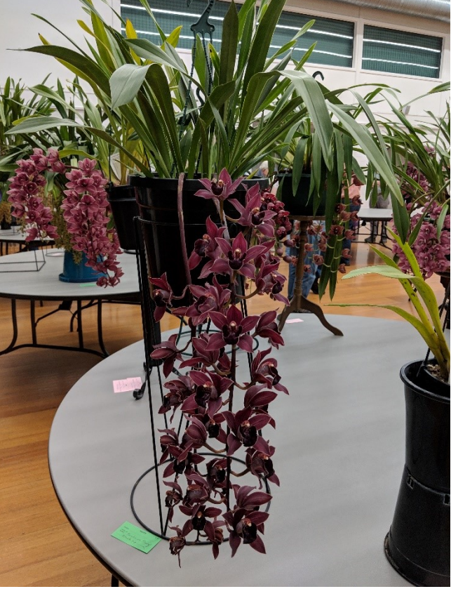
Cym. Paradisian Planet 'Black Lip' exhibited at the COSV meeting in November 2018.