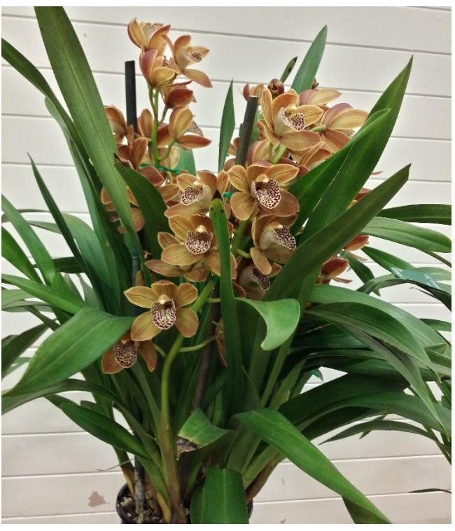
Two examples of Cym. Jean Terberg exhibited at COSV meetings between 2017 and 2019.