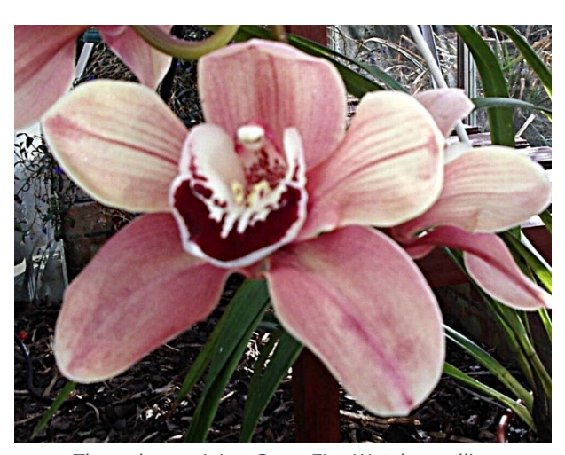
The only surviving Cym. Fire Watch seedling

It was now that I began making my first RHS registrations, with cymbidiums I named Ifritah and Iridium in 2004 plus Hot Wired and Fire Watch in 2006. The Ifritahs were the best of these, a crossing