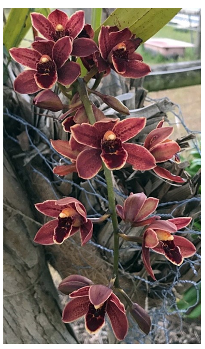
Cym. Mad Magic 'Mephistopheles'

Back in Adelaide in Australia, my mother was now unable to look after the few less impressive cymbidiums I had left there, so my younger brother took them on. Amongst them were several plants of crossings with Cym. madidum that were all of garbage bin size (carrying the propensity of the species for massive foliage), so were never in line to be taken to the U.K. However, despite its size, the one plant that I