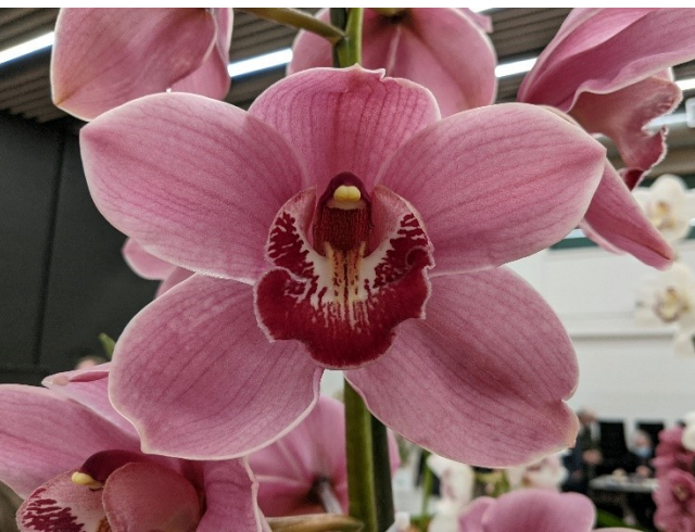
A seedling shown at a COSV meeting in 2021. It is the only one the author has seen with a strongly marked lip.