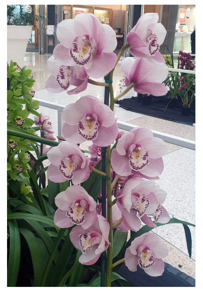
Cym. Amaroo 'June', which was champion seedling at a West Lakes Spring show in 2019.

He has also made several crosses with Joanstar 'Sensuous', commenting that "It is a very pretty, attractive flower... I have a liking for any colour with a soft blush pink lip. I am hoping that the blush lip will dominate in some progeny."