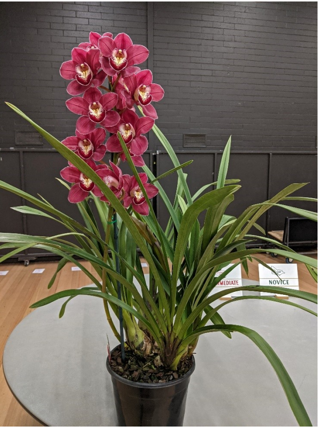
Cym. Wyong Fury. This plant won best seedling at the 2019 Dural Show (which was cancelled in 2020 & 2021).