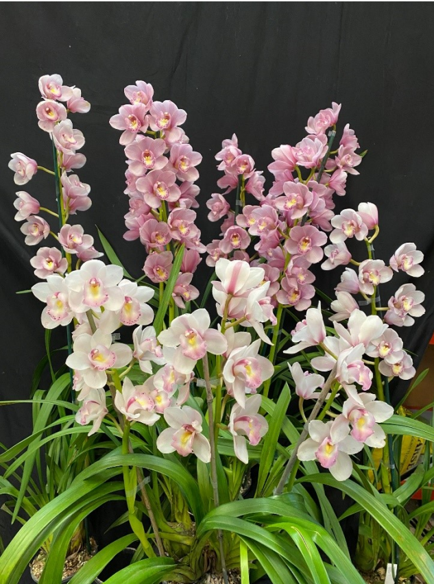
Cym. Amaroo 'Tee Pee' HCC/OSCOV.