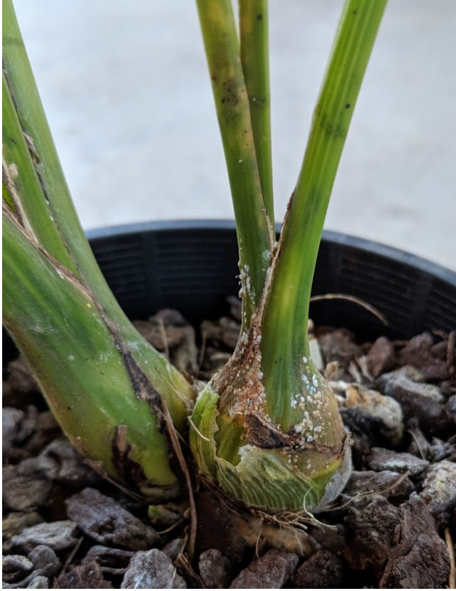
Scale insects typically congregate in the middle "V" of leaves, but love to hide under the leaf husks on pseudobulbs.