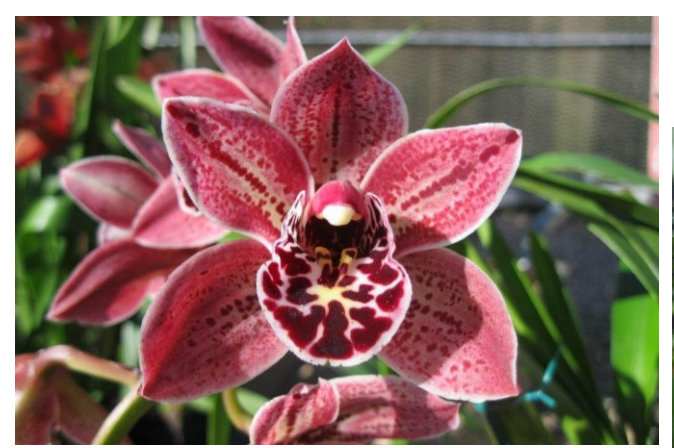
Cym. John McCormack 'Gold as Gold'.