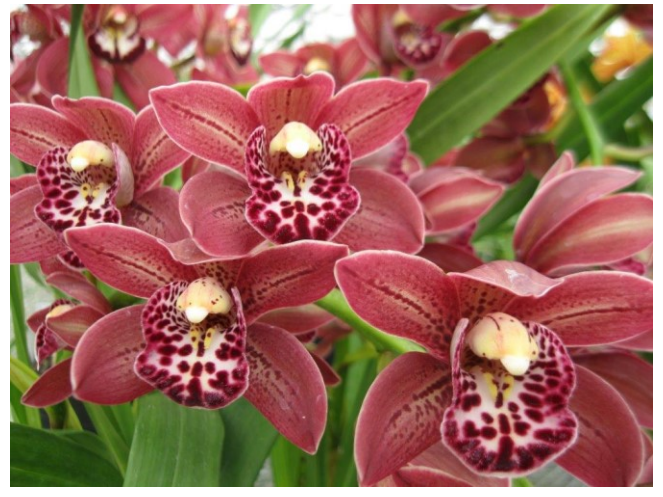
Cym. Red Planet 'New Horizon' 4n.

One hypothesis put forward for the long gap between the registration of Vogel's Magic in 1994 and the first hybrid in 2009 is that it wasn't until hexaploid (6n) mutations began to appear in the clones that fertility was restored. This would certainly explain Cym. Magic Chocolate (the hybrid with Cym. erythraeum registered in 2012), which is the only cross to list Vogel's Magic as the pollen parent. If correct, then most of the Vogel's Magic offspring will unfortunately be sterile pentaploids (5n) – the