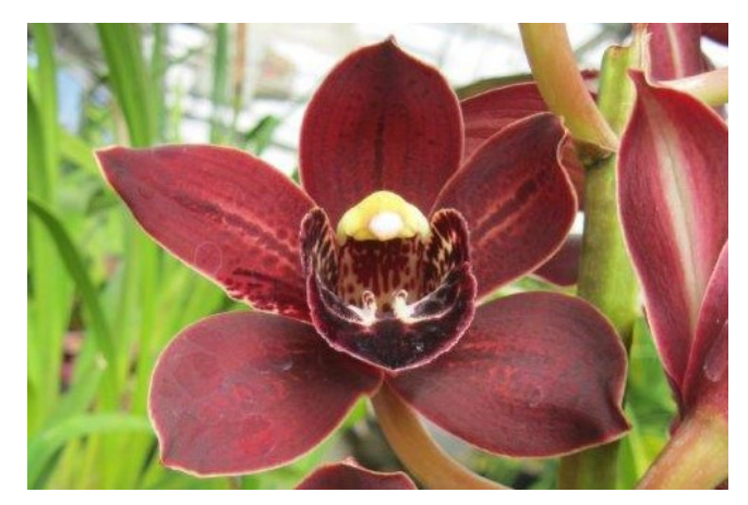
Cym. Noni Poland 'Salinas'.