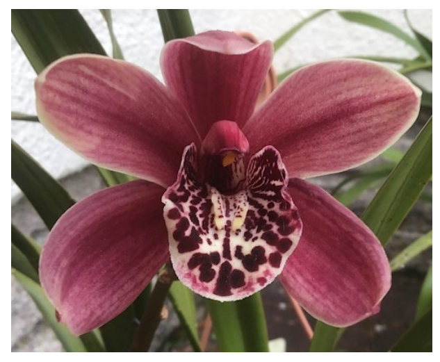
Cym. Bald Baroness 'Anita'

The only Cym. Fire Watch (my Cym. Coalfire 'New Horizon' 4N X Cym. Bud March 'Sandra' 4N) seedling to survive produced a large, but very disappointing flower overall (see picture), to the extent that I didn't even name it, and it won't cross with anything. I have ended up with 2 pieces of it which weathered all rots, though I wish it had been other plants that had survived.