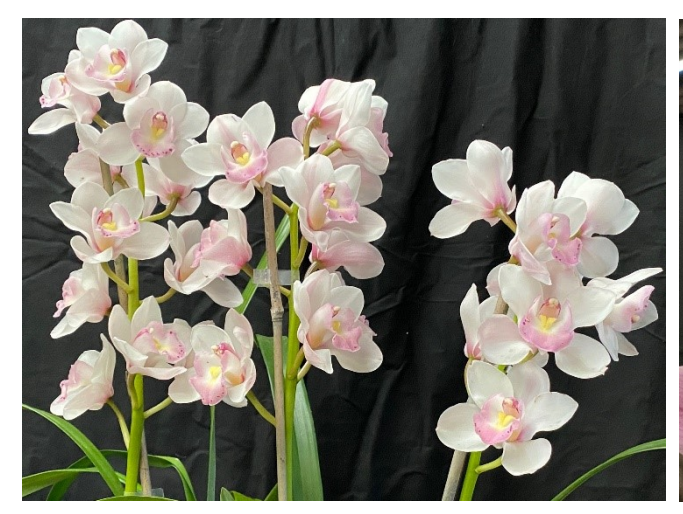
A pastel example of Cym. Amaroo.

The grex is currently popular, with unflowered seedlings fetching $50 to $60 at a Cymbidium auction in Adelaide earlier this year and up to $70 on eBay for unflowered plants in spike.