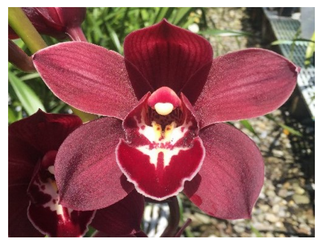
Cym. Red Shift #1.

On the growing front, my latest bane has been single night late frosts in April this year and last, when I had taken my plants out of the glasshouse believing winter was over. I got caught on both occasions, with some severe plant damage and losses. The worst this year was the reduction of a multi-bulbed plant with several new shoots of Cym. Kuranda to one just shoot, which has subsequently rotted.