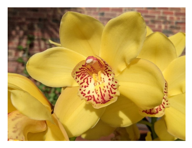
Cym. Yellow River 'Fleurijn', a Dutch cut flower selection from the 1990s.