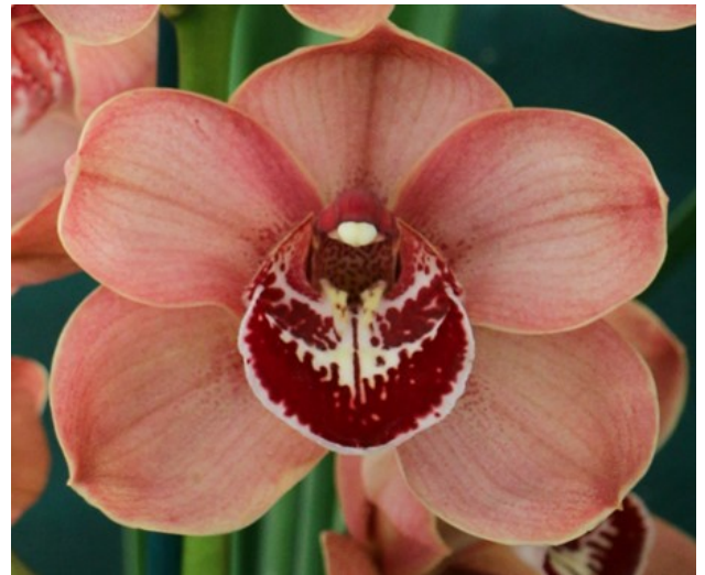
Two different flowerings of Kimberley Pass 'Victoria' - one in Melbourne, the other in Perth.