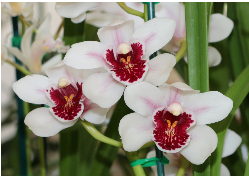
Left: (Yai x Darch Tai) 'Raspberry Ice'