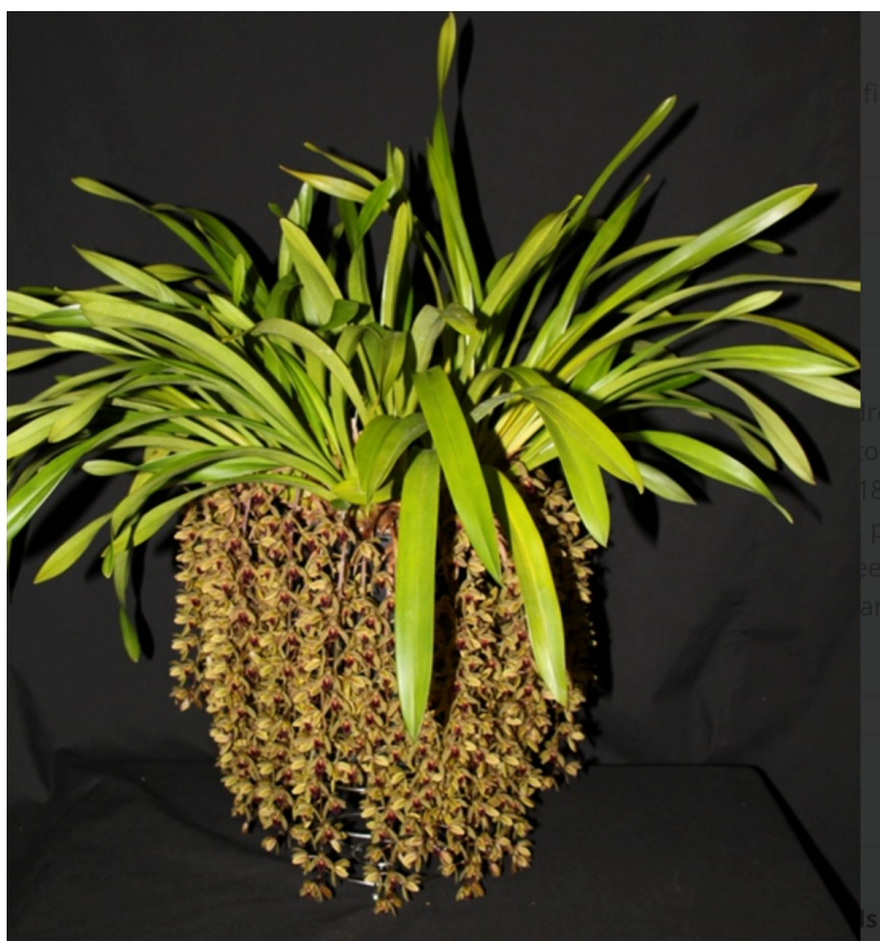
Sweet Devon 'Sweet' CCM/AOS 91pt June 2012 Exhibitor: Leo Galvan