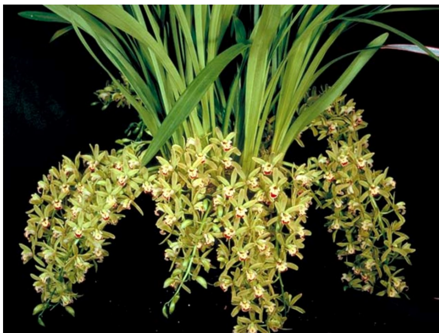
Orchid Conference 'Chitoshi' CCM/AOS 89pt March 2011 Exhibitor: Michiaki Kawano

When I spoke of the pendulous craze dipping downward, it referred to the Northern parts of Ca. There are few hybridizers left of the pendant Cym. type and the primary one of the past ten years is now listed as a "hobby grower". The primary problem with many of the current pendants is the large pseudo bulb size with inflorescences of 3' to 4'+ in length. Clarity of color is improving. For the average orchid grower these take up an enormous amount of space. The original pendants had shorter inflorescences of 12" to 18" and smaller bulbs, thus far easier to handle. They always put out a better display of multiple inflorescences. Once the madidum species came into the mix, even though the number of flowers on an inflorescence may have increased, small plant size went out the window.