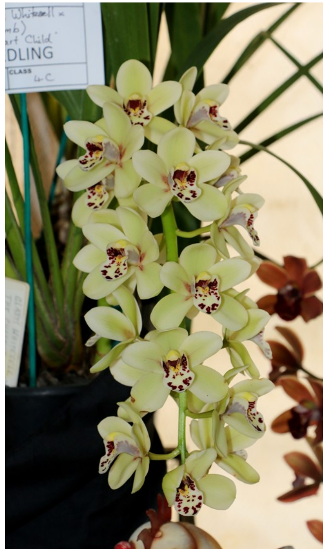
Above: (Gladys Whitesell x Tom Thumb) 'Smart Child' Left: (Coral x Darch Dots) 'Dotty'