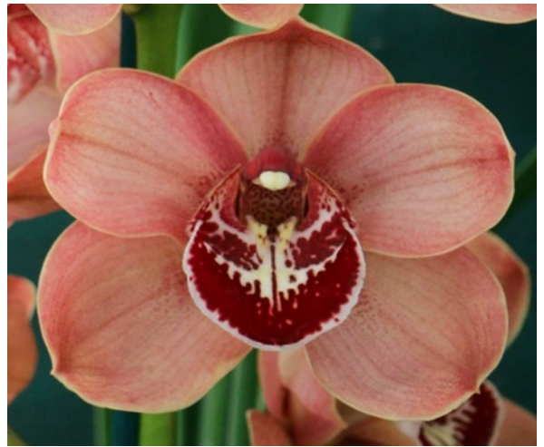
Cym Kimberley Pass 'Victoria'

Welcome to this edition of Cymbidium Chatter, boy isn't the year disappearing quickly. It would seem that the lockdown measures put in place here in Victoria are at last starting to have an effect. Please continue to follow the guidelines, stay safe and well!