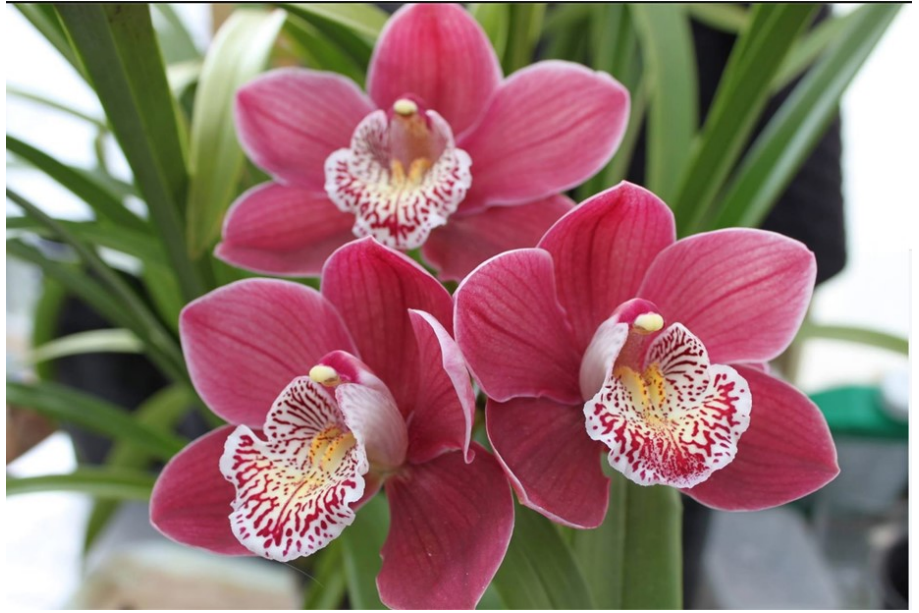
Two different flowerings of Cym Wallamura 'Jupiter' - one here in Melbourne, the other in California, USA.