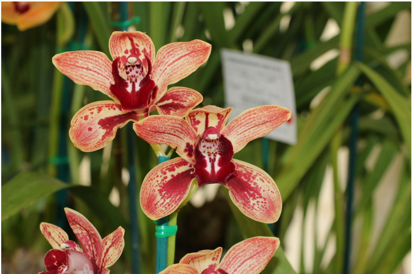
Cymbidium (Darch Splat x Darch Dots) 'Sloth'