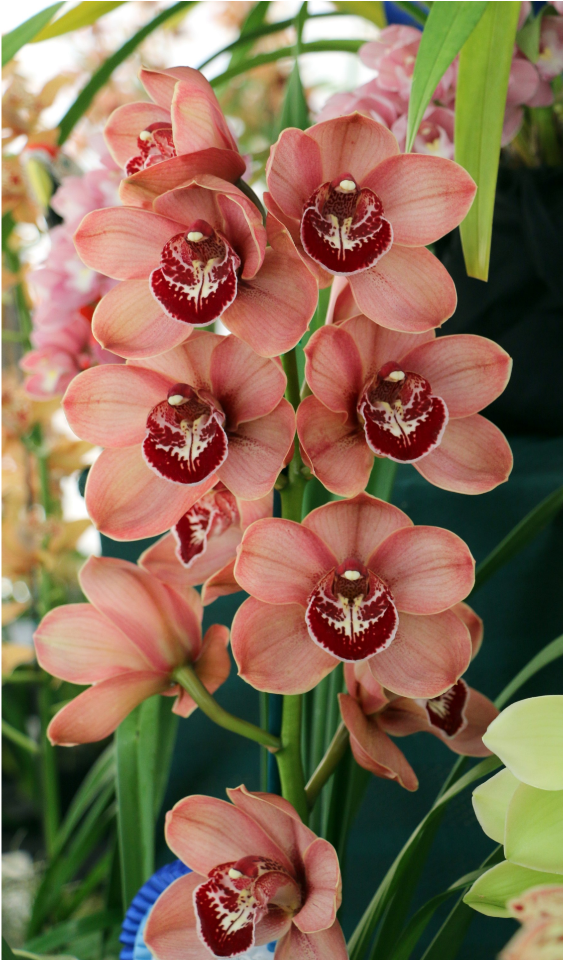
Grand Champion of the COCWA Winter Show - Cym Kimberley Pass 'Victoria'