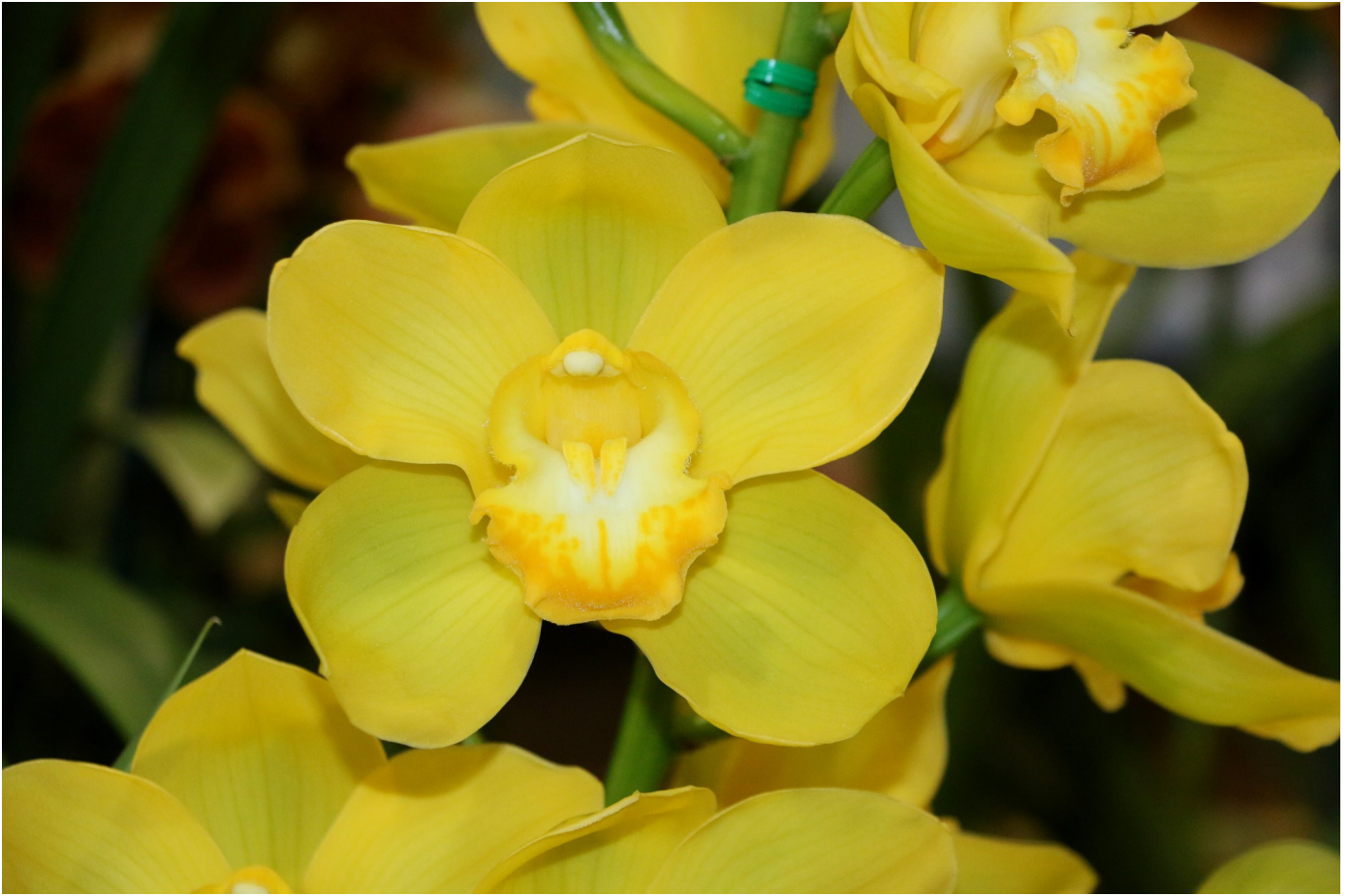
Cymbidium Albryant 'Superstar'