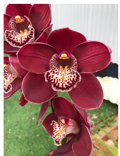
First flowering seedling - Serhan's Passion 'Marion' x Lunar Blaze 'Ruby'

Welcome to the next edition of Cymbidium Chatter. Sadly, the news concerning the virus has worsened and I imagine it will be sometime before we can meet again. Many shows have already been cancelled, so all we can do is enjoy our Cymbidiums as they begin to open. The cold weather has certainly slowed down the development of the flowers.