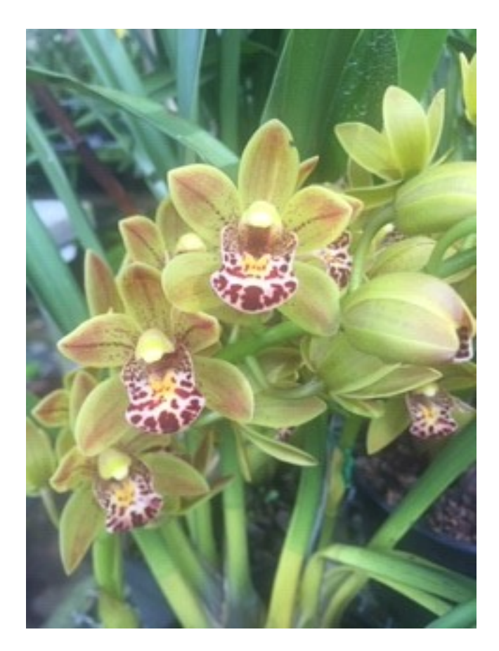
Enzan Floss 6n x Cym pumilum 2n