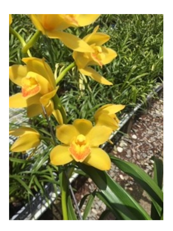
(Don Wimber x Gold Rules) #1 4n

Very interesting 4n line. Mini with two spikes of 20+ blooms on each spike. Seedlings coming along nicely from this parent. Gamechanger!