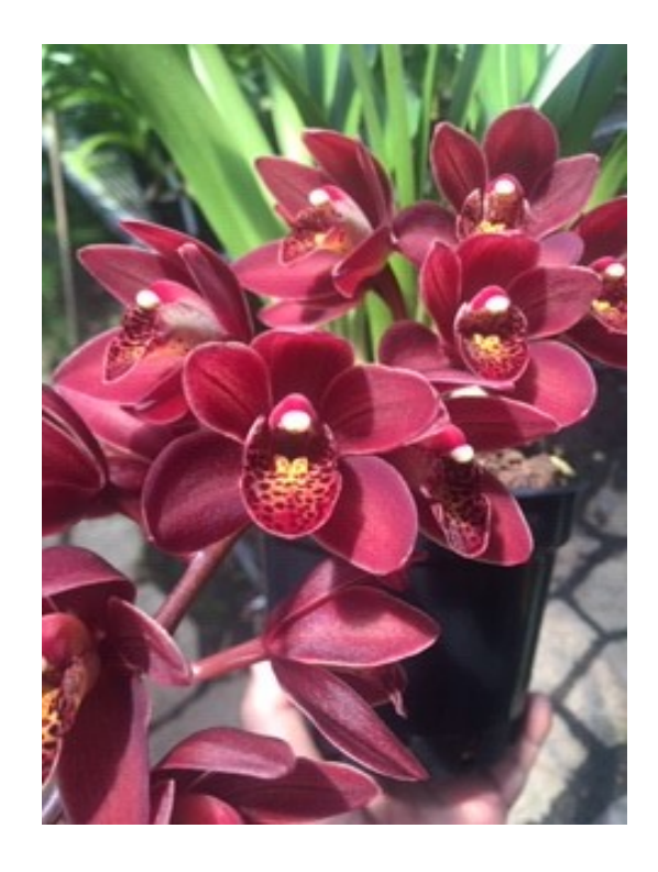
(Phar Lap x Devon Parish) 'El Retiro' 4n

Still the best alba yellow WT intermediate we have in the collection. All photographs and text below photographs from A Easton.