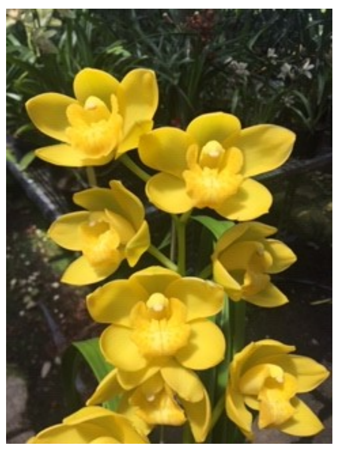
William Petterson 'NH' 4n

Still the best alba yellow WT intermediate we have in the collection. All photographs and text below photographs from A Easton.