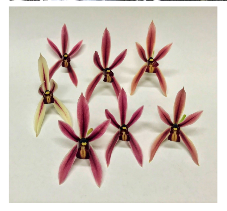
Above left: the three color forms of Cymbidium dayanum

Above right: the tetraploid (4n) red form of Cymbidium dayanum