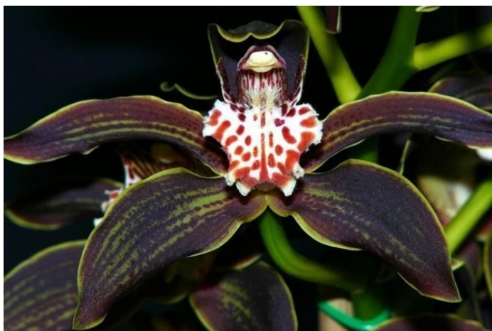
Cym tracyanum 'New Start' AM/OSNSW