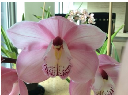
Khan Fury 'Nerolie' x Kurunulla 'Maestro'