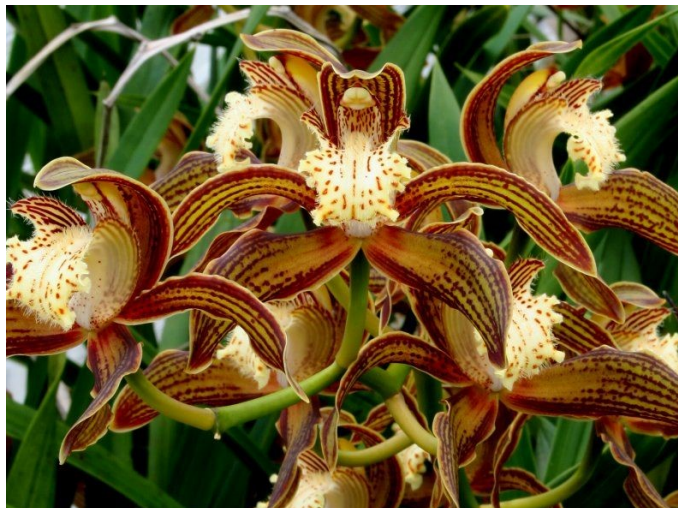
Cymbidium tracyanum

Welcome to this edition of Cymbidium Chatter, I hope it finds you all well and enjoying a little more freedom now that the restrictions have been eased slightly. I think the governments, State and Federal, should be congratulated for guiding us through these strange and difficult times. We can only hope that everyone continues to observe social distancing guidelines. No doubt businesses throughout the State are hurting, however, I think the conservative approach has been warranted. I can think of nothing worse than going back into more severe lockdown measures. I think the 'hasten-slowly' approach, is the correct one! Stay safe and well!