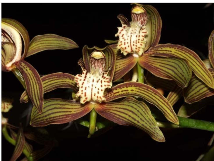
Cym tracyanum 'Burmese Bronze'