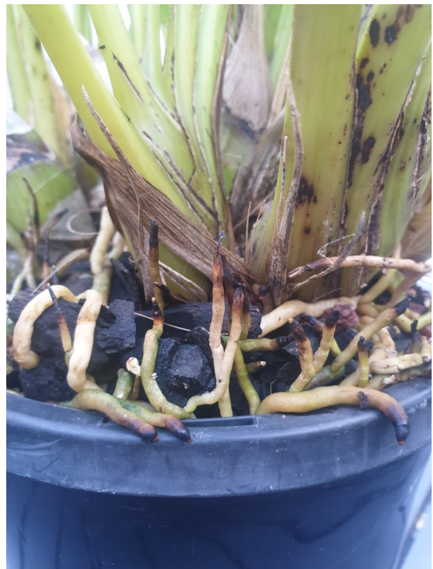
My newly acquired plant of Cymbidium tracyanum , a green variety, with the second photo showing the characteristic aerial roots (the finer vertical roots).