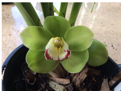
(Royal Fare x Coral Reef) x Southern King 'John Mata'