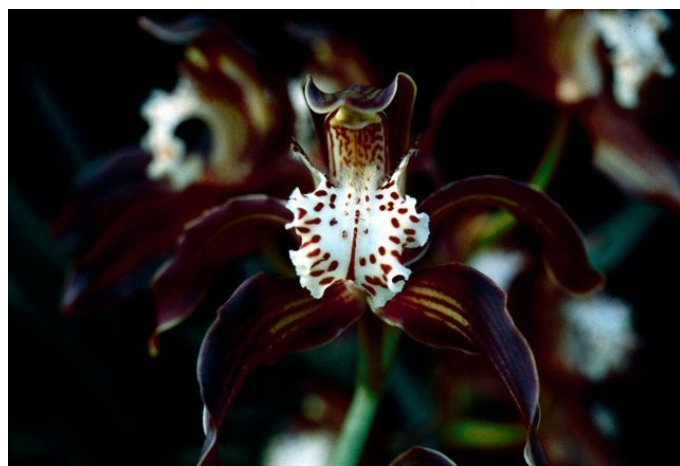
Cym tracyanum 'Red Knight' AD/OSCOV

This is a teraplod form of Cym tracyanum