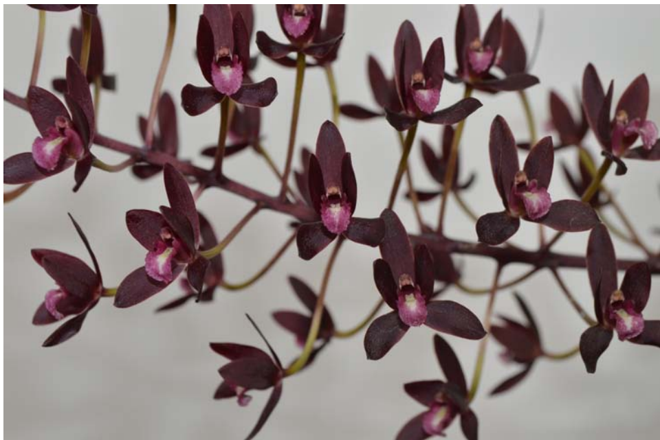
November meeting 2014, canaliclatum Sparksii “King River”