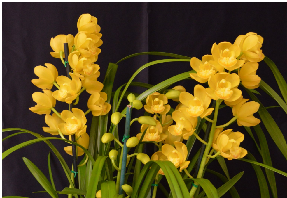
Judge's Choice, Best Overall and First Division Best Intermediate Yellow Pharoah's Dream Grown by Chee Ng