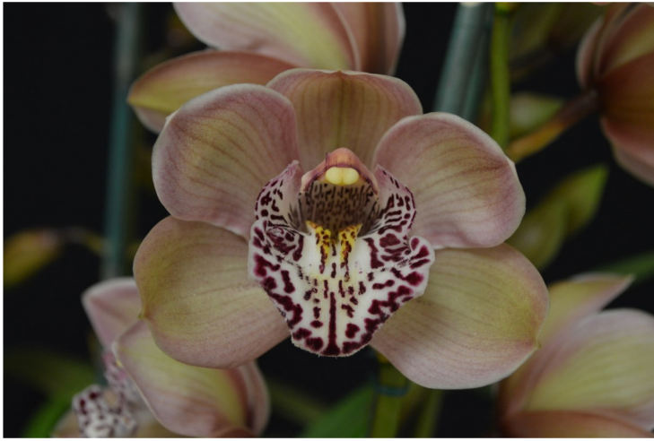
Valley Freestyle “Heaven Scent”

First Division First prize Intermediate Polychrome