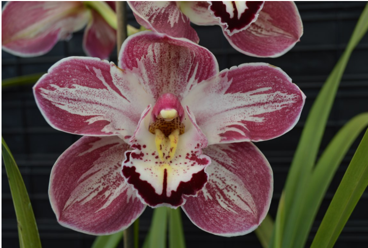
Valley Champion “Flash”