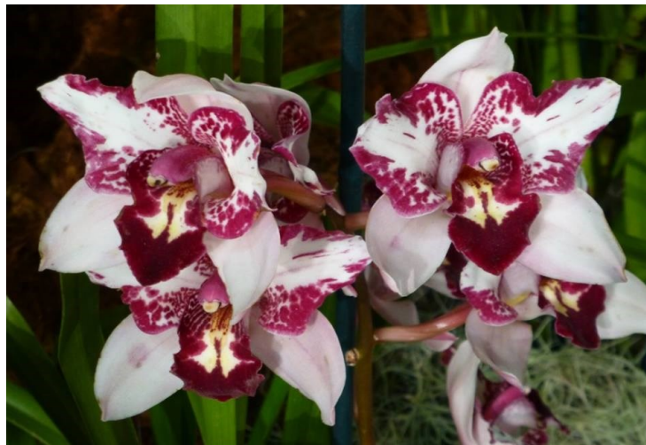
Strathdon x Cherry Shower “Butterfly”

A first flowering seedling, shown at the recent Santa Barbara International Orchid Show