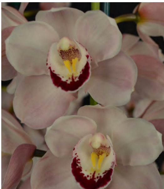
OOTY Finalist Sims Vision Barcelona Grown By Rodney Philp