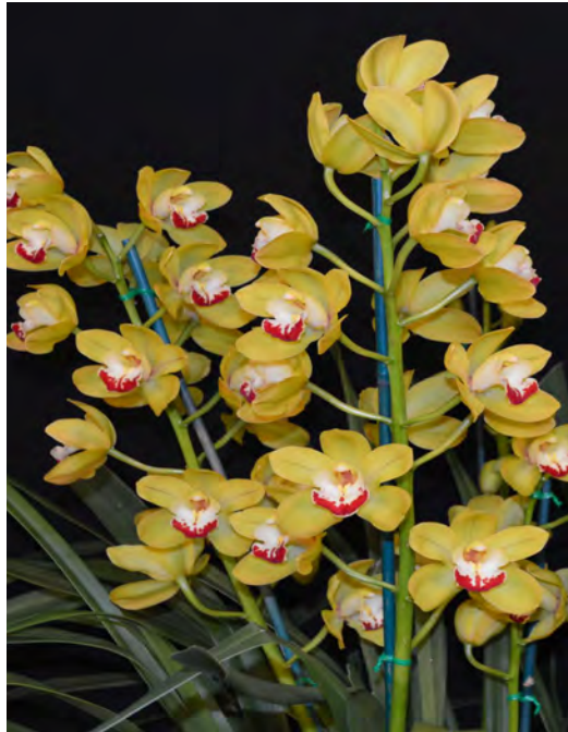
OOTY Finalist One Tree Hill 'Beenak' Grown By M & G Hazeledine