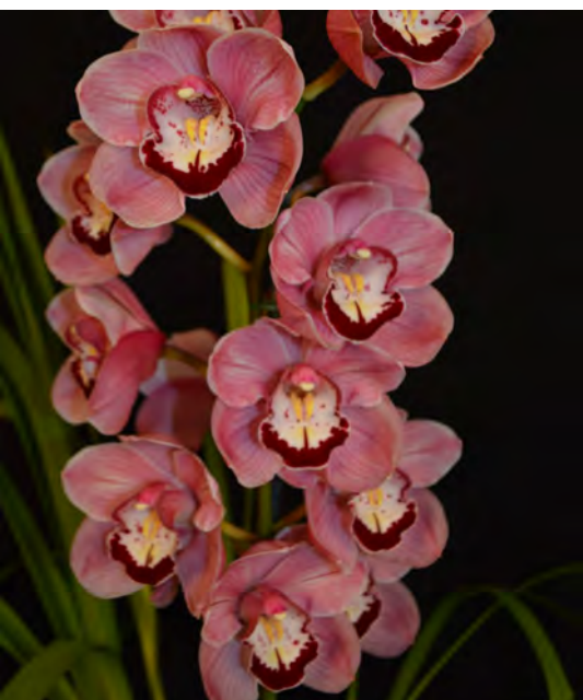
OOTY Finalist Red Beauty x Sims Vision Grown By Glenn Steares