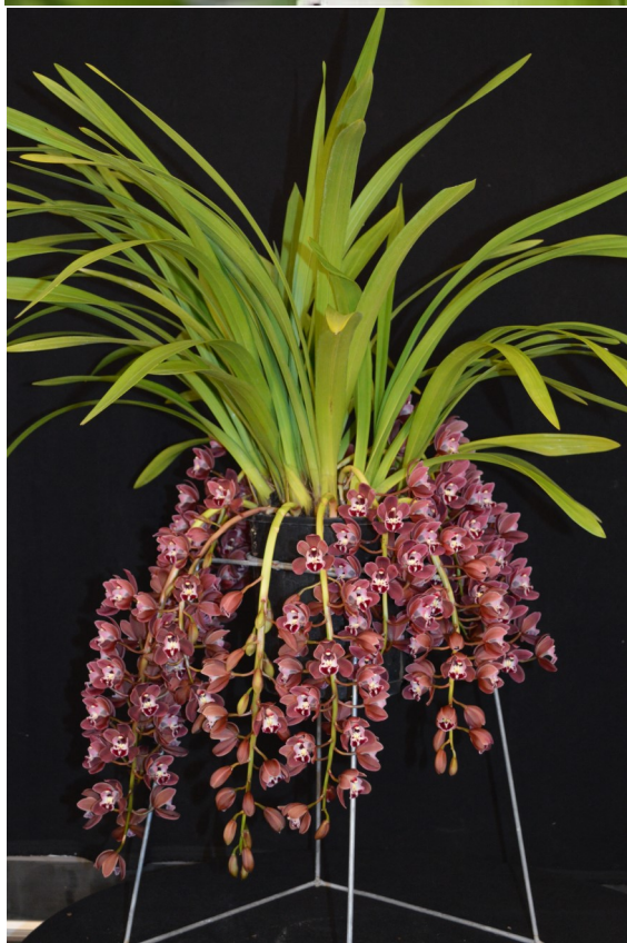
Photo at left is Fairy Rouge 'Lavender Falls' Which is the plant which was divided and given to the Beginner's Group At the October meeting