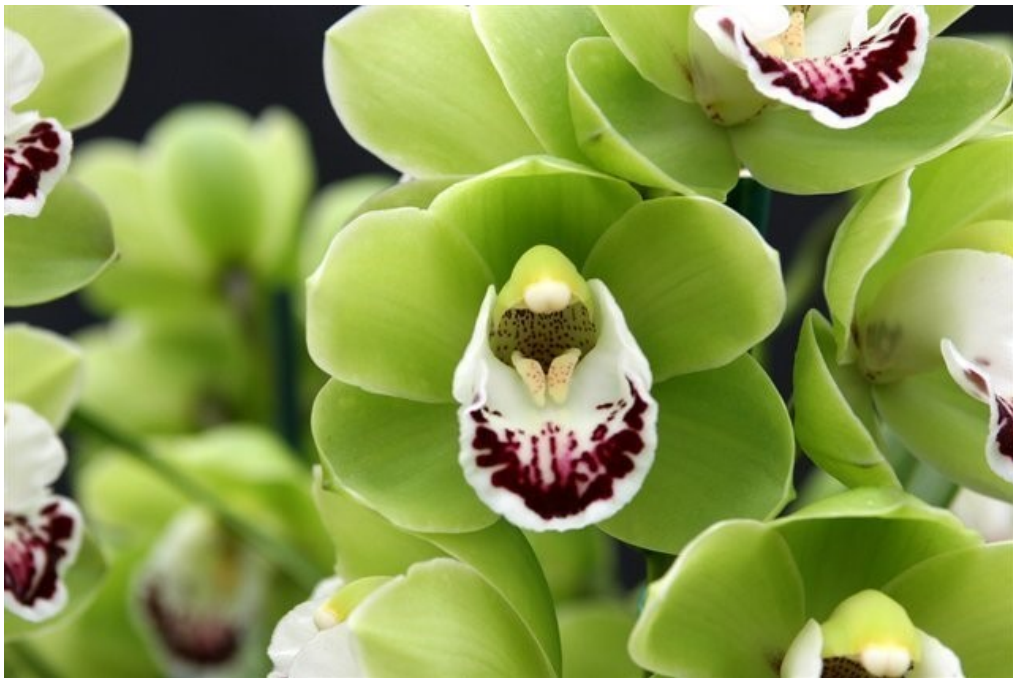
Photo above plant will be of interest to the Beginner's Group Details at the November meeting beginner's group Templestowe Opal