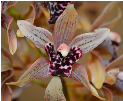
September 2018 Meeting , Best in First Division, First Miniature Other Colour Dry Devon Grown by George Misirlis

This was a well grown small plant with 5 open inflorescences and one in bud. They were fairly evenly distributed around the pot. There were 20 plus flowers per spike, beautifully arranged, looking at you from all directions. The flowers were starry shaped, and the flower segments were sprinkled with small dark brown spots on a creamy, light brown background. The labellum showed heavy, strong