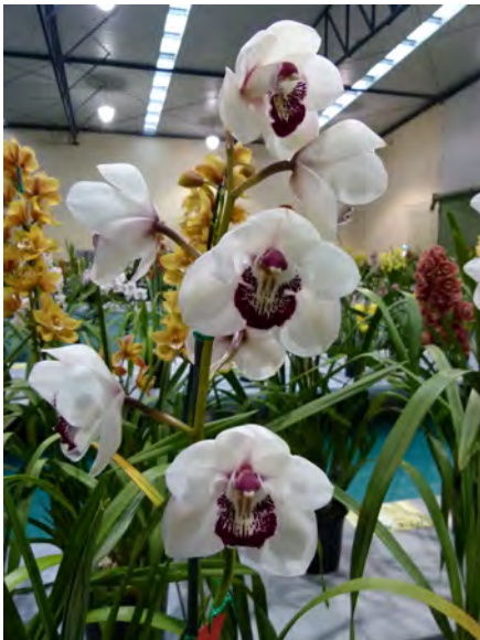
Champion Seedling at Dural Show 20178 Elle Ronis x (Joan's Charisma x Spring Flame) See this in colour on your computer