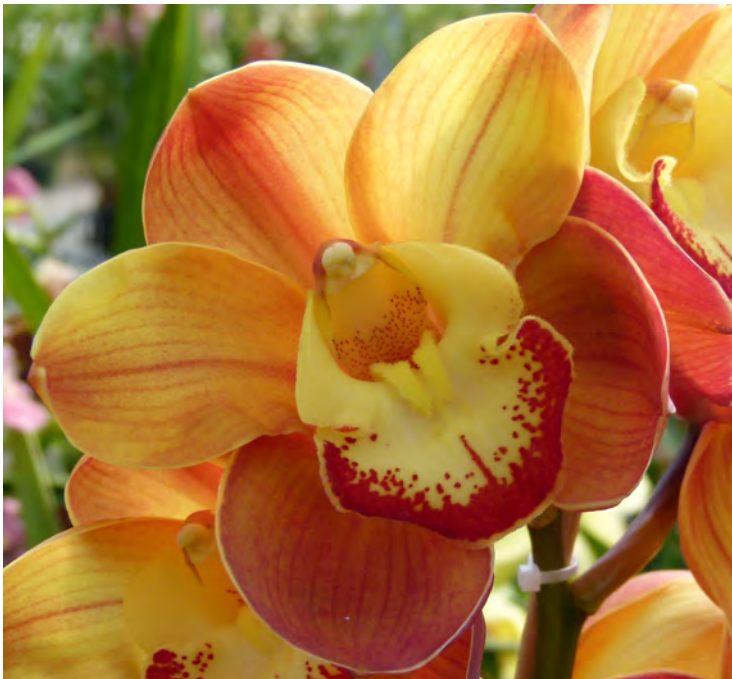
These 2 plants were on display at Baritta Orchids during the Dural Show Names might be revealed later See this in colour on your computer