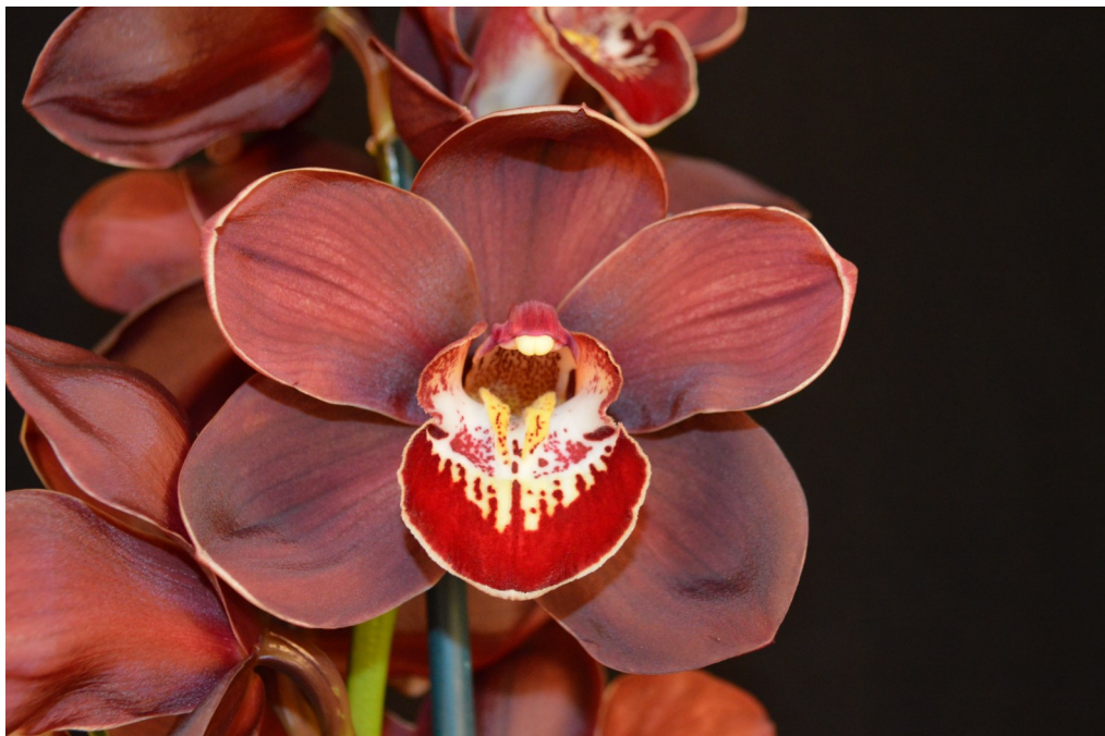
(Above) July Meeting Best Large Standard Seedling