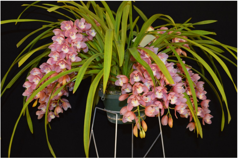
(Above) July Meeting