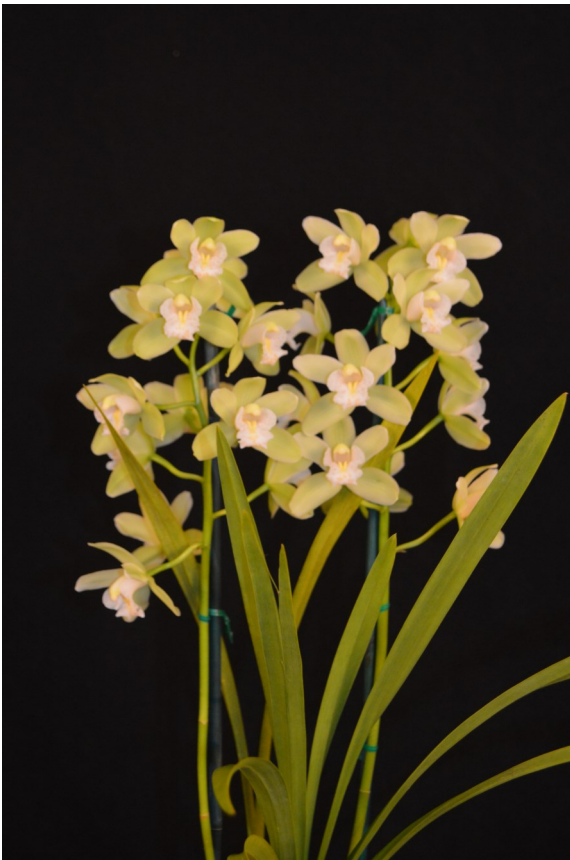
(Left) Best Miniature Seedling