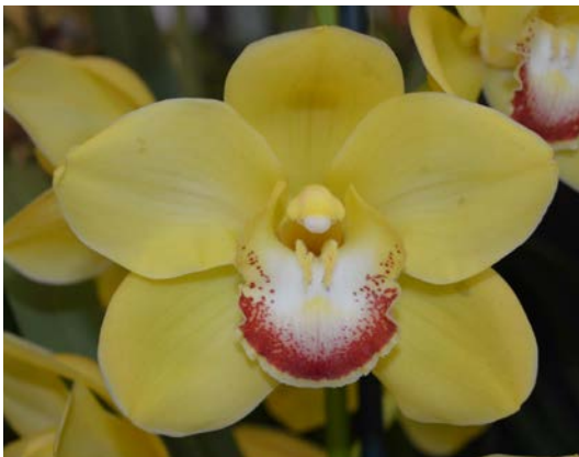
At left and below Coraki Glowing Grown by Chee Ng