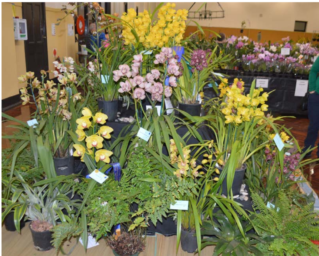
Above The left hand side view of our display at the SAROC Show 2019