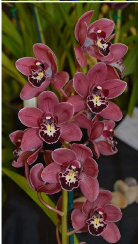
At left and below SAROC Show 1st in Red/Pink less than 60mm Valley Fire Grown by Graham norris