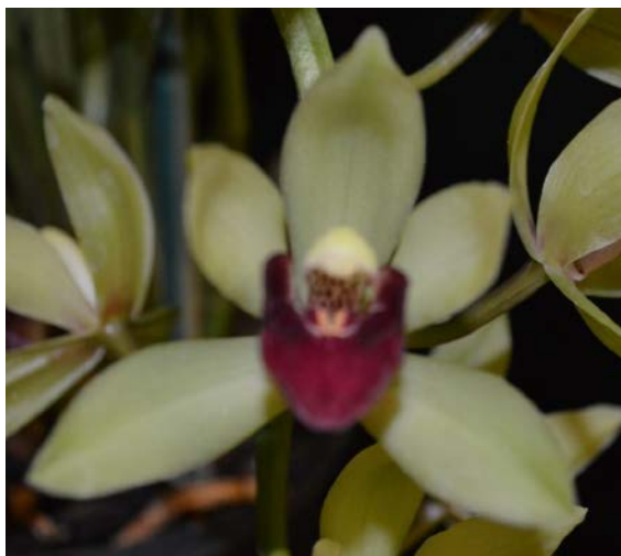
Open Division 1st Intermediate Green Zig-Zag 'Kiwi'