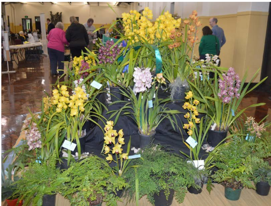
Above The right hand side of our display at the SAROC Show 2019