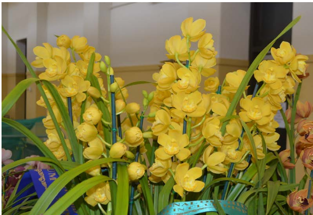
Above Champion Cymbidium at the 2019 SAROC Show Pharaoh's Dream 'Dural' Grown by Chee Ng