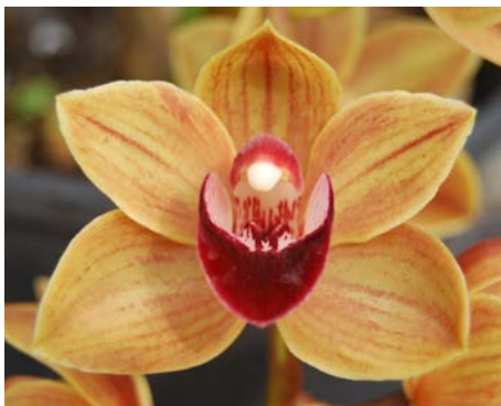
At left Mem Amelia Earhart 'No.6'