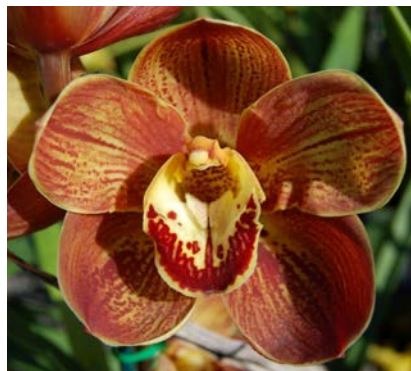
Above Sundaani Dream 'Mclaren Vale'