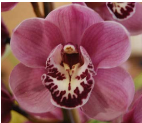
At left Khanebono 'Jacinta'