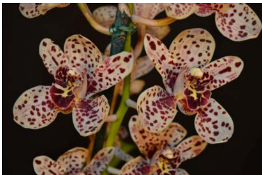
At left Spotted Madam 'Issa'